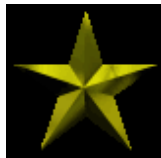
Honor Unit with Distinction