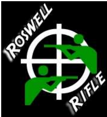
The Hornet Rifle Team Logo

The Hornet Rifle Team has shot extremely well this year. The team, consisting of all juniors and one freshman, has won all but one match. On February 26th, the team outshot White County, who beat the shooters last year. On March 4th, the Rifle Team will shoot at